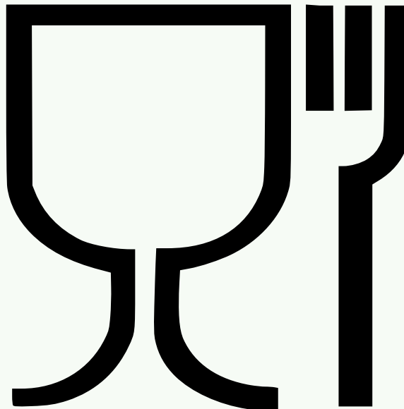
Figure 3: Article 15 of the Framework Regulation (EC) No 1935/2004 on materials and articles intended to come into contact with food specifies the labelling requirements. It says that food contact materials shall be accompanied by the words “for food contact” or the above symbol, unless it is obvious that the article is intended for food contact.

Article 15 of the framework regulation (EC) No 1935/2004 requires that materials and articles not yet in contact with food shall be accompanied with the words “for food contact” or a specific indication as to their use, such as coffee machine, wine bottle, soup spoon, or the symbol depicted below. If necessary, the label shall also contain special instructions for safe and appropriate use, such as restrictions on type of food to be packed in the material or article.